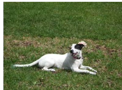
Chloe Roder of Fall Creek is a natural model...she posed for several good pictures!